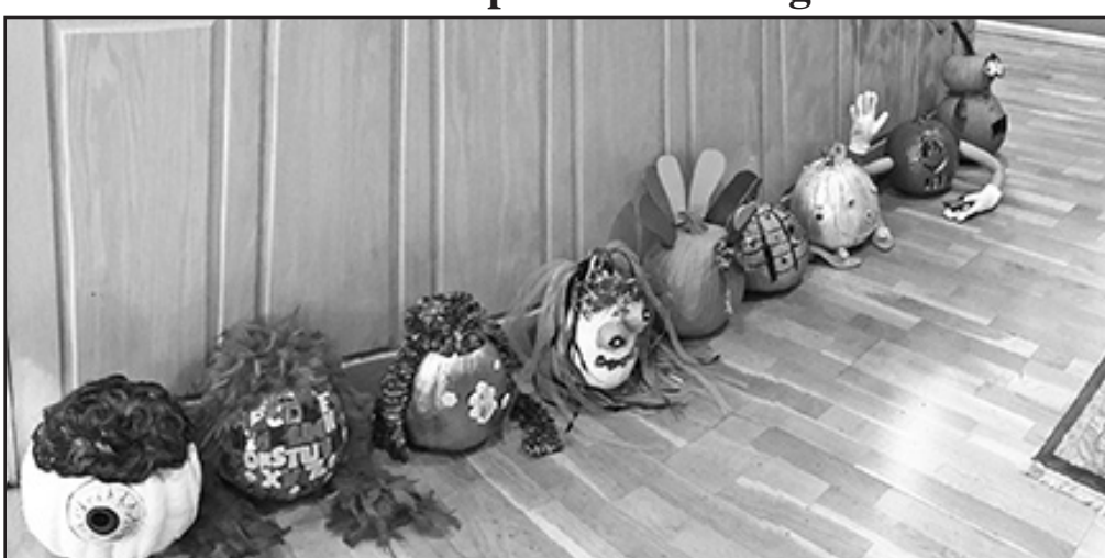
Entries included (L-R) a Cyclops, a "Smart" pumpkin, Frozen (2nd prize winner), Queenie (1st prize winner), Mr. Turkey, Spider's Web, Princess, Red M&M and Owl.